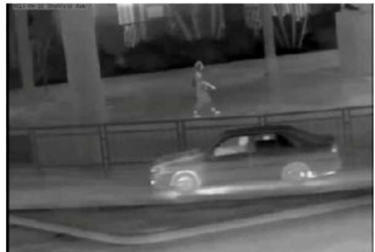
Night road monitoring