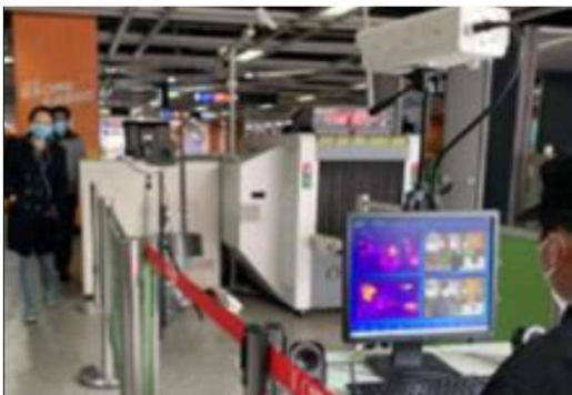
Human Temperature Measurement