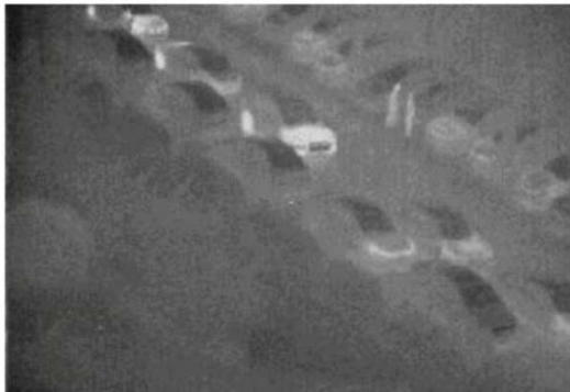
Night remote parking monitoring